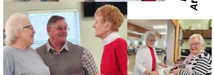
Life & Fun At Jamestown